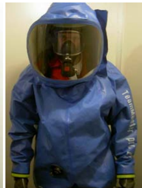
XV and XVI

Photos XIII and XV show the position of the body core temperature sensor.